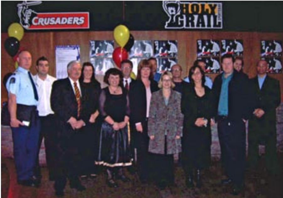
Members of the Accord Management Committee